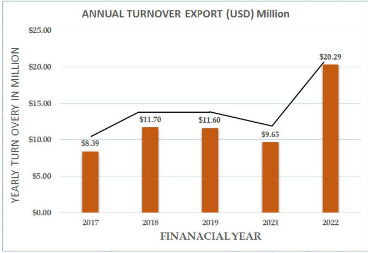
Annual Export value Graph preview