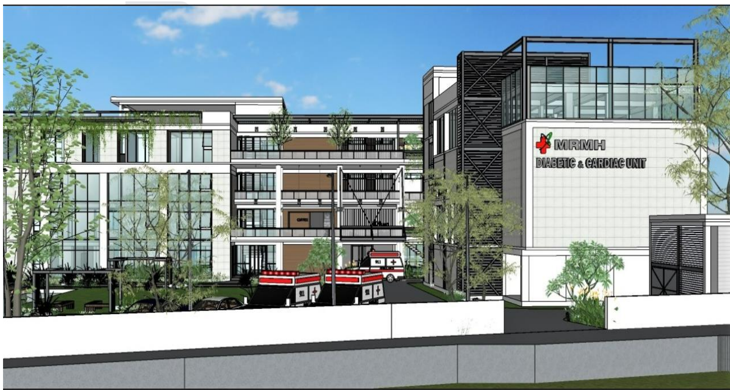
PRIVIEW OF UPCOMING NEW CSR PROJECT

Having spontaneous response from the threshold humanity and to mitigate the crying need of prevailing health condition the group has taken a new step forward by initiating the development work of Cardiac & Diabetic unit. We are expecting of this new unit at the end of 2023.