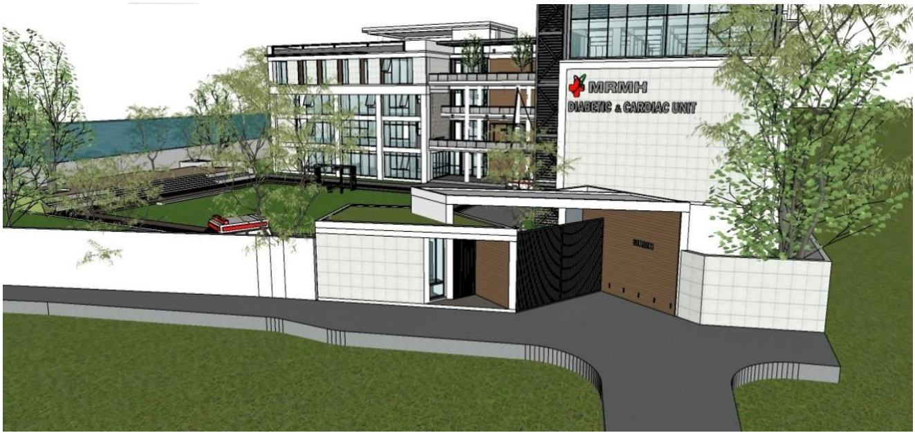
Picture-6: View of Mahbubur Rahman Memorial Hospital (Diabetic & Cardiac Unit)